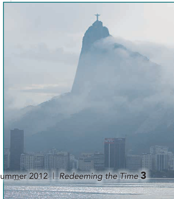
Below: The giant Christ the Redeemer statue stands atop Corcovado, and can be seen from most places in the city. It is a reminder of the heavy influence held by Roman Catholicism in Brazil and most of South America.