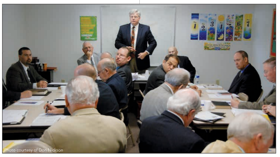
The ACCC Executive Committee in session.

As a clearly identifiable movement, Biblical fundamentalism is not yet 150 years old. In its earliest phases, it gave voice to the foundational doctrines taught in the Bible and did so without reference to any particular denominational perspective. The earliest conferences, beginning in 1876 at Niagara-on-the-Lake, Ontario, Canada, focused on that which various denominational groups held in common. It was the heritage, they argued, that had come down through the generations from the ministry of the apostles of Christ. As J. Gresham Machen observed, the movement was not the latest of a series of new "isms," but the restatement of the historic Christian faith.